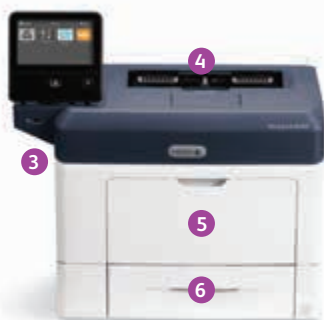
Xerox® VersaLink® B400 Printer Print.