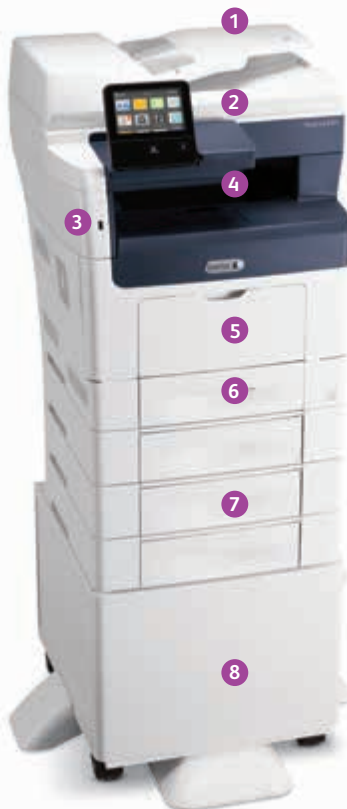
Xerox® VersaLink® B405 Multifunction Printer Print. Copy. Scan. Fax. Email.