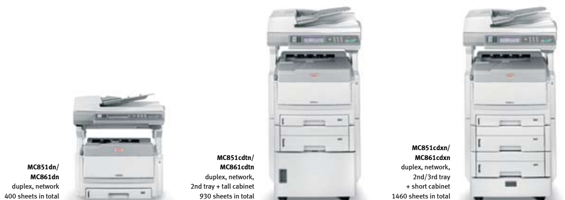
MC851dn/ MC861dn duplex, network 400 sheets in total