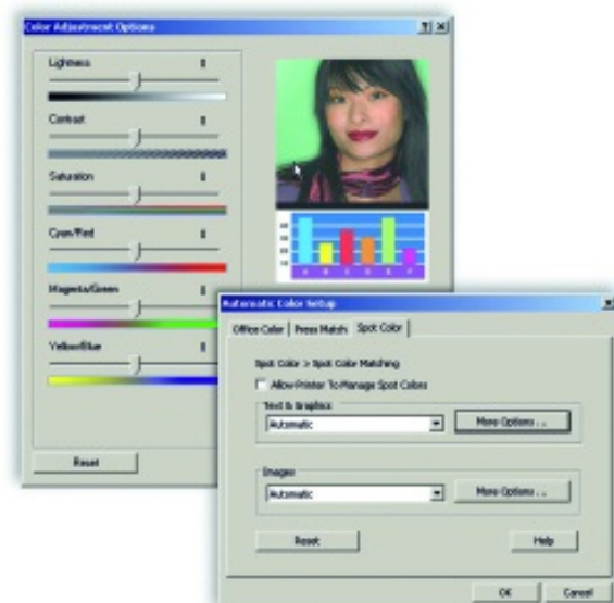
Advanced colour tools allow you to fine-tune output to your specifications.