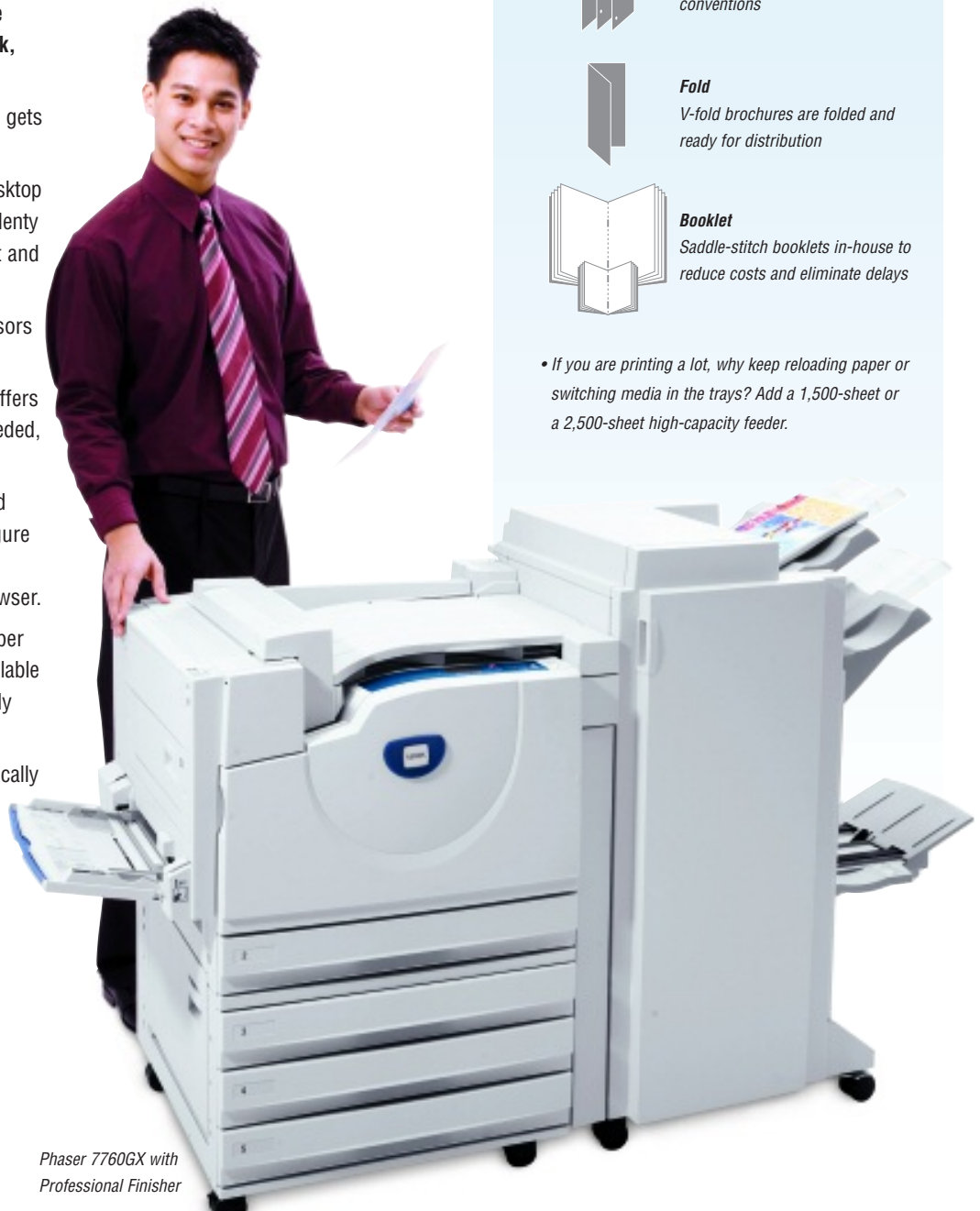
Phaser 7760GX with Professional Finisher